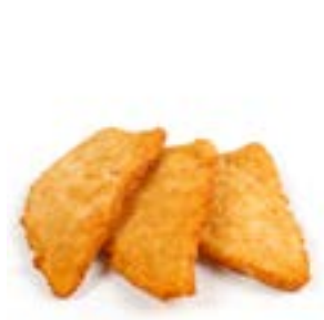
Summer Chicken Cutlet

Approx. 3.5 oz pcs / 50 pcs per case / 11.5 lb case