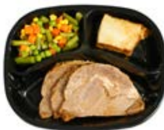
Pot Roast of Beef with Gravy, Potato Kugel, & Vegetable Medley