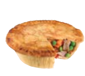
Beef Pot Pie Approx. 18 pcs / 10 lb 05-BPPFS