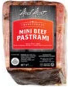
Plate Pastrami Chunk

12 per case / approx. 1 lb ea. / 12 lb case