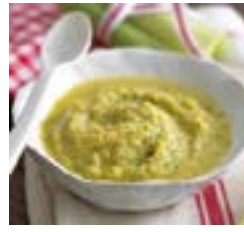
Puree Of Fish

with Savory Mashed Potato & Pureed Carrots