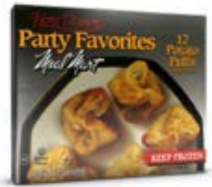
Mini Potato Puffs