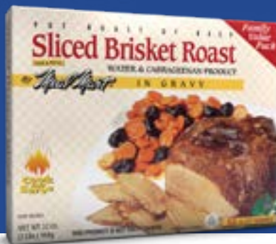
Family Pack Sliced Brisket