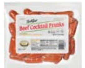
Beef Cocktail Franks