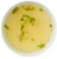
Chicken Broth No Salt