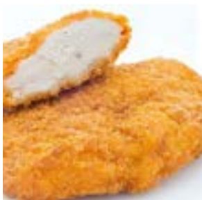
Breaded Chicken Breast Cuts

1 oz ea./approx. 160 pcs per case / 10 lb case