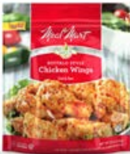
Buffalo Wings Mild