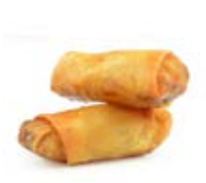
Pastrami Egg Rolls 30/5 oz / 9 lb 05-PERL