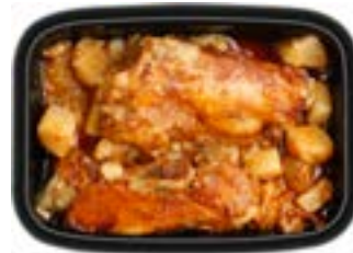
Roasted Chicken with Diced Potatoes