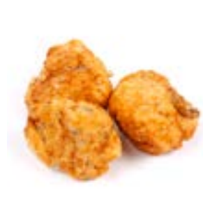
Breaded Breast & Wings