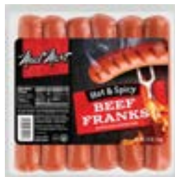
Hot & Spicy Franks