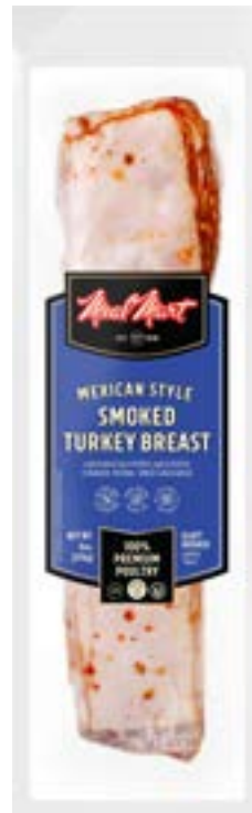
Mexican Smoked Turkey Breast