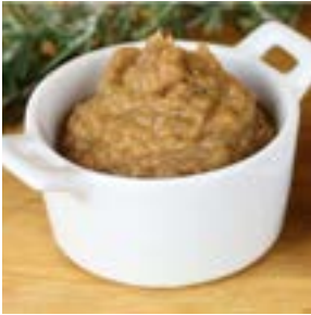
Puree of Beef, Cooked and Seasoned

50 pcs per case / 3.2 oz each / 10 lb case