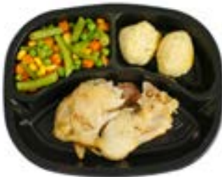
Boiled Chicken Bottom in the Pot with Matzo Balls, Garden Vegetables