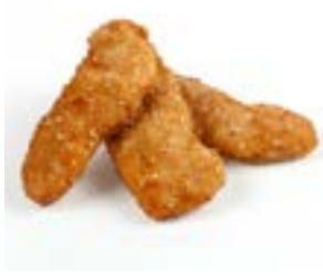
Sesame Chicken Tender