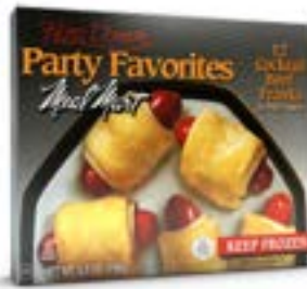
Cocktail Beef Franks

12 per case / 5.5 oz ea. / 4.125 lb case