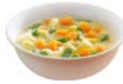
Parve Vegetable Soup No Salt