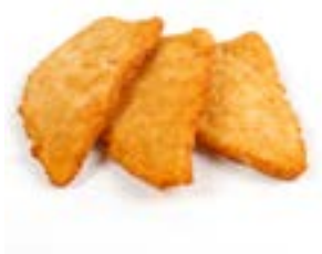
Breaded Chicken Breast Cutlets