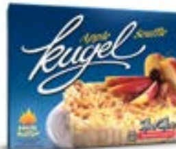
Apple Noodle Kugel