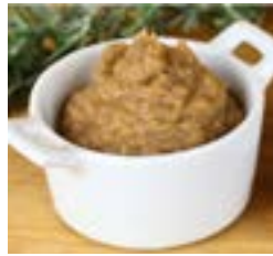
Puree of Beef with Rice & Peas