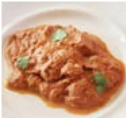
Puree of Chicken with Rice & Green Beans