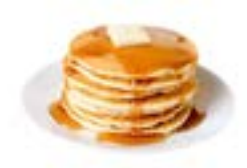
Pancakes with Syrup