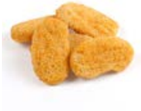
Breaded Chicken (Summer Camp)