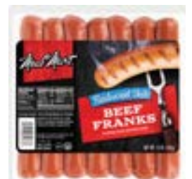
Reduced Fat Beef Franks