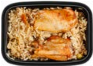
Roasted Chicken with Rice Vegetables