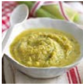
Puree of Fish, Seasoned

50 pcs per case / 3.2 oz each / 10 lb case