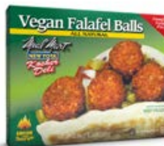
Family Pack Falafel Balls