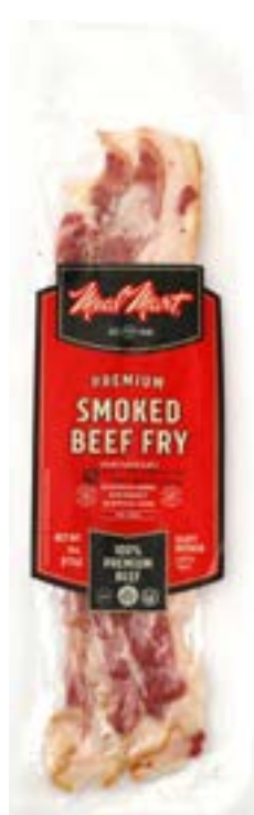
Smoked Beef Fry