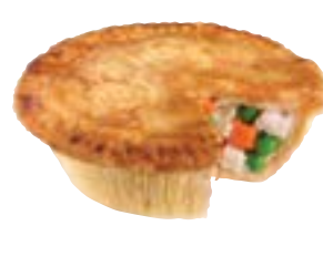
Chicken Pot Pie