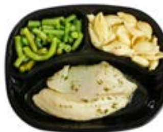
Filet Of Sole with Lemon Parsley Sauce, Shell Pasta & Green Beans