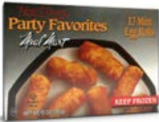
Mini Egg Rolls