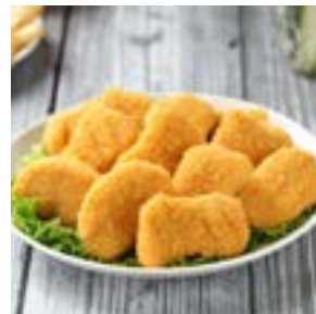
Breaded Chicken & Turkey Nuggets

1 oz ea. / approx. 160 pcs per case / 10 lb case