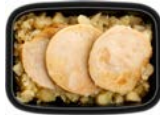
Turkey Mashed Potato