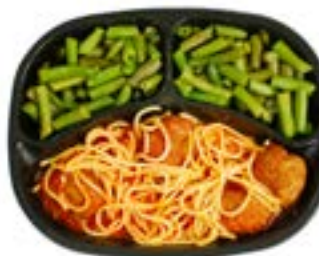
Spaghetti & Meat Balls in Tomato Sauce with Green Beans