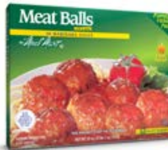
Family Pack Beef Meat Balls