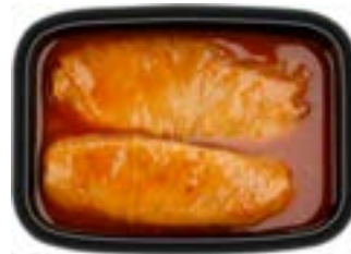
Beef Stuffed Cabbage with Tomato Sauce