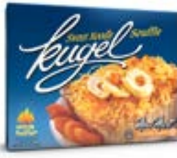
Sweet Noodle Kugel