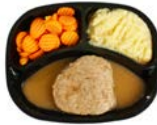
Salisbury Steak with Gravy, Whipped Potatoes & Seasoned Carrots