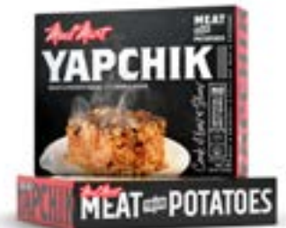
Meat & Potato Kugel Yapchik