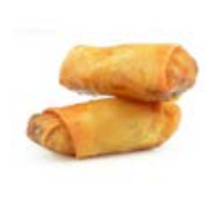
Cocktail Egg Rolls Approx. 170 pcs / 10 lb 05-ERL10