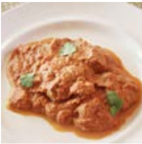
Puree of Chicken, Cooked and Seasoned

50 pcs per case / 3.2 oz each / 10 lb case