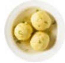
Chicken Broth No Salt with Matzo Balls