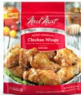
Honey BBQ Chicken Wings