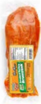
Smoked Turkey Drumsticks

12 per case / approx. 1 lb ea. / 12 lb case