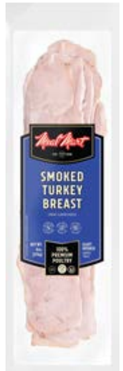
Smoked Turkey Breast