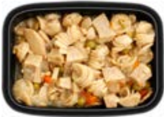
Chicken Primavera with Pasta