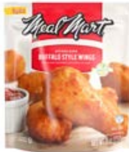
Boneless Buffalo Style Wings