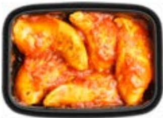
Cheese Ravioli (Parve)