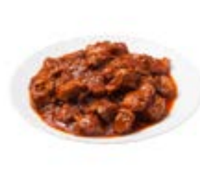
Beef Goulash (Cooked) 2/10 lb casing / 20 lb case 71-CBG