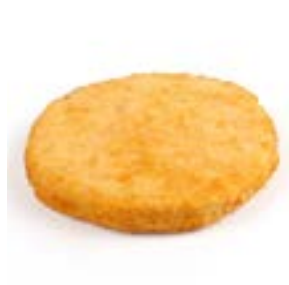
Breaded Turkey Veal Patties Approx. 30 pcs / 9 lb 03-FTVP