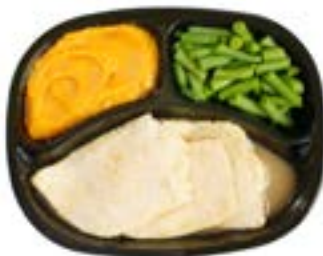
Roast Turkey with Gravy, Sweet Potato & String Beans