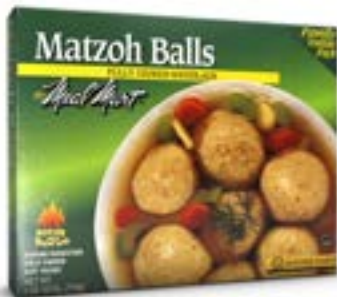
Family Pack Matzoh Balls