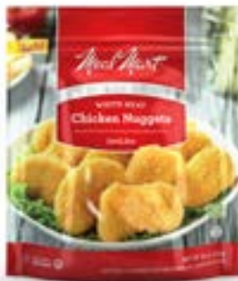
Chicken Breast Nuggets