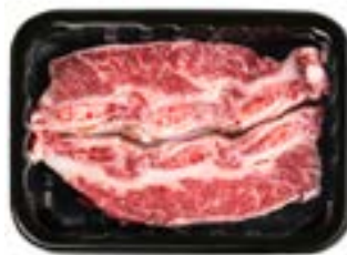
Plate Short Ribs