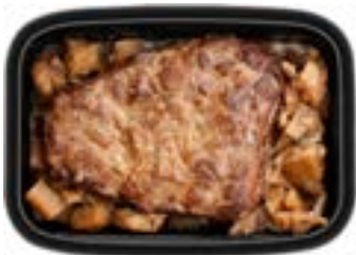
Vegetarian Salisbury Steak