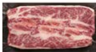
Plate Short Ribs

12 per case / approx. 1 lb ea. 91-65507RS