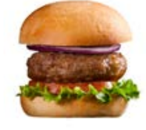
Beef Sliders (Mini Burgers) Approx. 94 pcs / 1.7 oz each / 10 lb 91-BEEFS