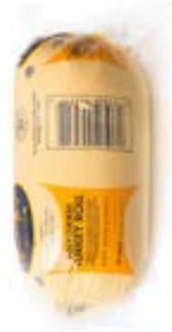
Turkey Roll Chub

12 per case / approx. 1 lb ea. / 12 lb case