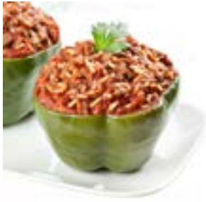
Stuffed Peppers with Beef In Sauce In Box 4 trays per case / 6 lbs per tray / 24 lb case / 8 oz pc / 12 pcs per tray 05-BPSPS