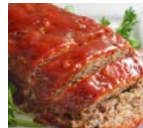
Traditional Mix Meatloaf (Raw) 8 loaves / approx. 24 lb case 71-MTM