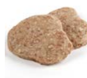
Raw Salisbury Steak Approx. 40 pcs / 10 lb case 51-RSS