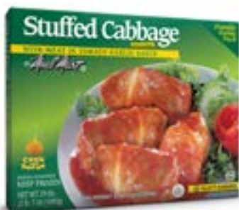
Family Pack Beef Stuffed Cabbage