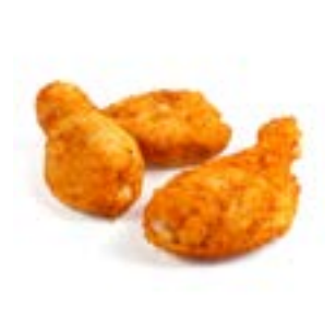
Breaded Thigh & Drum