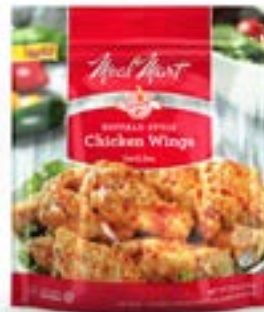
Buffalo Wings Hot