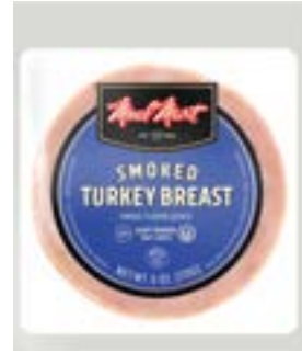
Smoked Turkey Breast