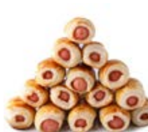
Cocktail Beef Franks in French Dough Approx. 288 pcs / 9 lb 08-FKS9