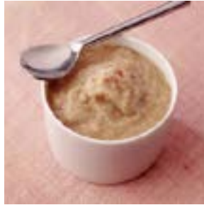
Puree of Turkey, Cooked and Seasoned

50 pcs per case / 3.2 oz each / 10 lb case