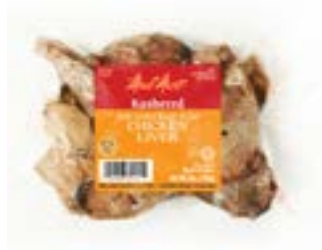
Retail Chicken Liver