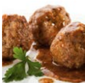
Beef Meatballs I.Q.F. 10 lb case 05-MB10