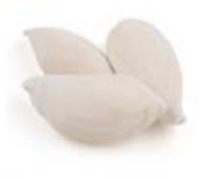
Beef Kreplach 6/2 lb bag / 12 lb 05-BPKRE