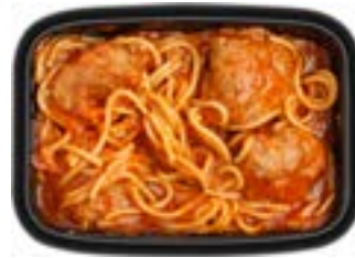
Spaghetti & Meatballs