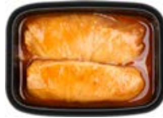
Vegetarian Stuffed Cabbage