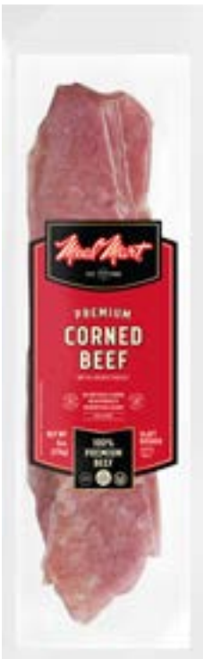
Cooked Corned Beef