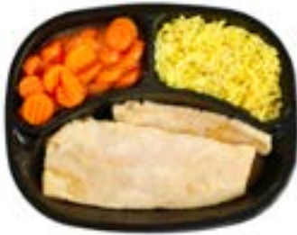
Boneless Roast Chicken with Gravy, Carrot Tzimmes & Rice Pilaf