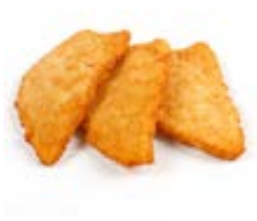
Breaded Chicken & Turkey Cutlet