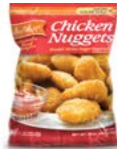
Chicken Breast Nuggets